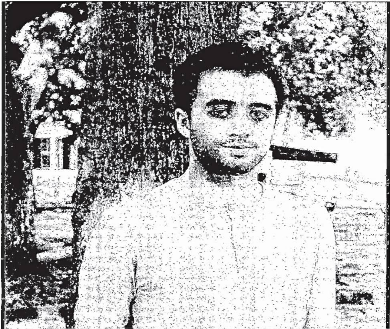
Exhibit (4): "Noah Pozner" all grown up